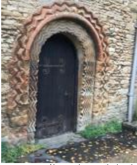
Norman door, south elevation